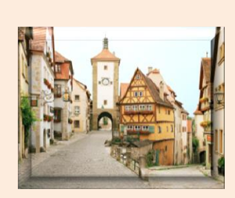
Explore Rothenberg, Germany