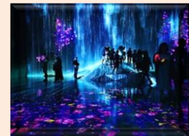
Team Lab Experience