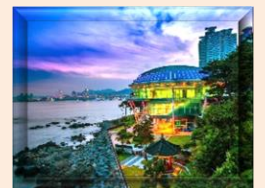
Dongba Island and APEC house