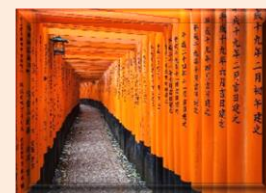
Fushimi Inari Taisha Gates