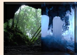
Mt. Fuji Wind and Ice Caves