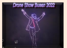
Drone show at Gwangalli Beach