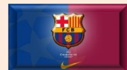
FC Barcelona Stadium