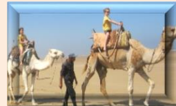
Camel Rides in Morocco