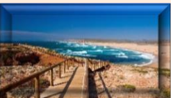
Algarve Beach Time