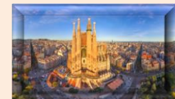
La Sagrada Familia