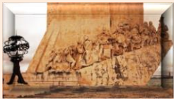
Monument to the Discoveries