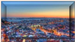
Lisbon at Night